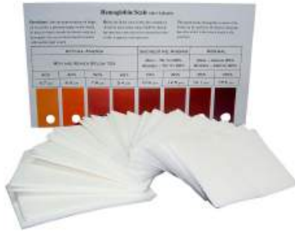
Figure 1. Tallquist haemoglobin scale [11].